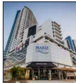
THE CAPITAL PEARLS - UMHLANGA 6 FEB - 7 FEB