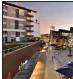
THE CAPITAL MENLYN MAINE - PRETORIA 3 FEB - 4 FEB