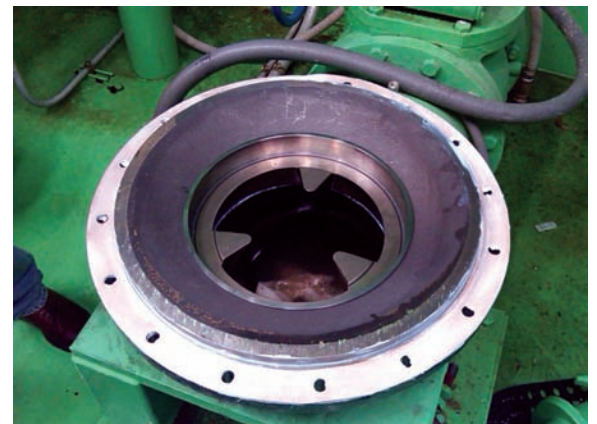
SUCTION COVER WITH OUTFITTED STATIONARY COVER